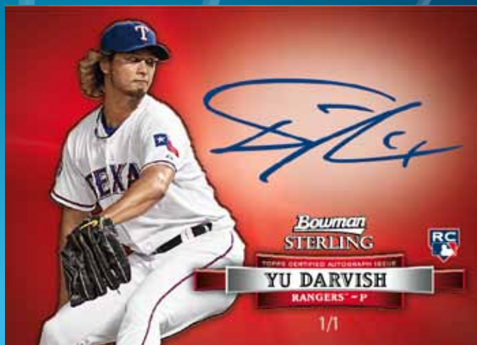
Auto Rookie Red Refractor Card