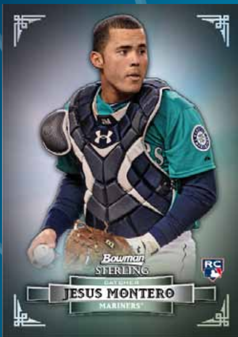
Base Rookie Card