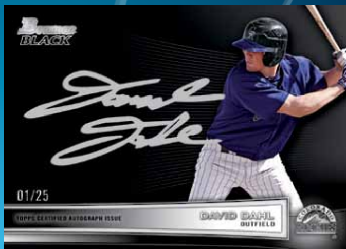
Bowman Black Card