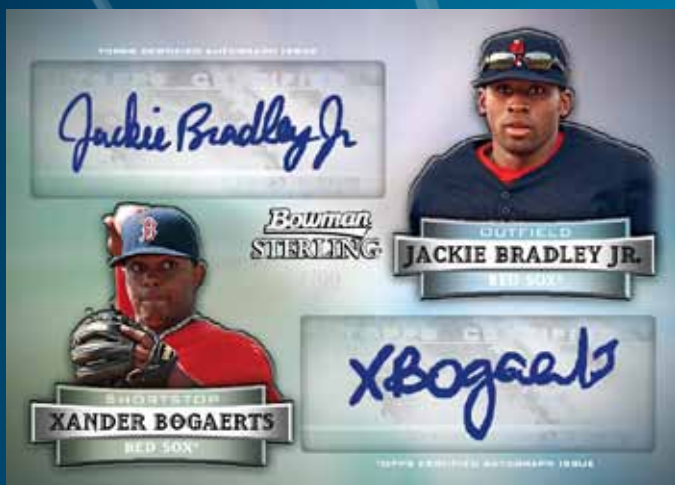
Dual Autograph Card