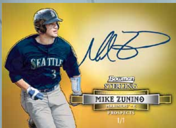
Auto Canary Diamond Refractor Card