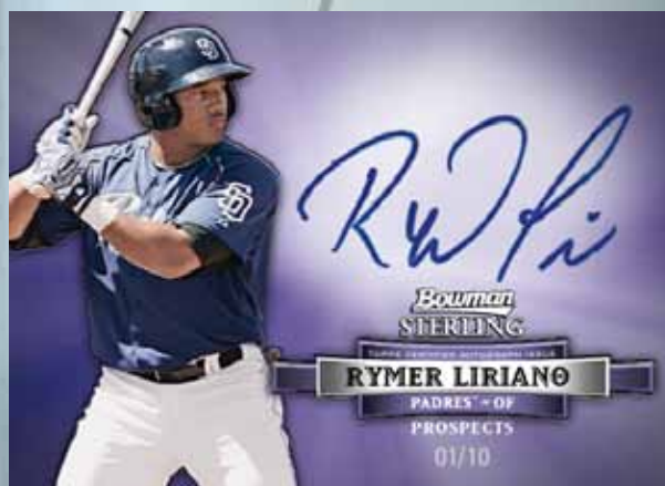
Auto Prospect Purple Refractor Card