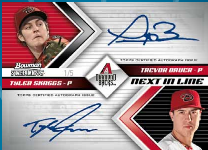
Next In Line Card