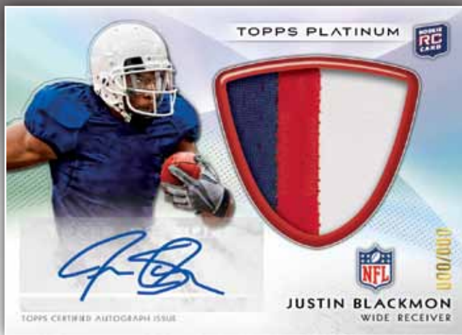
Autographed Rookie Refractor Patch Card

Double-sided card featuring six autographs of the most collectable rookies. Seq #'d to 10. Hobby Packs!