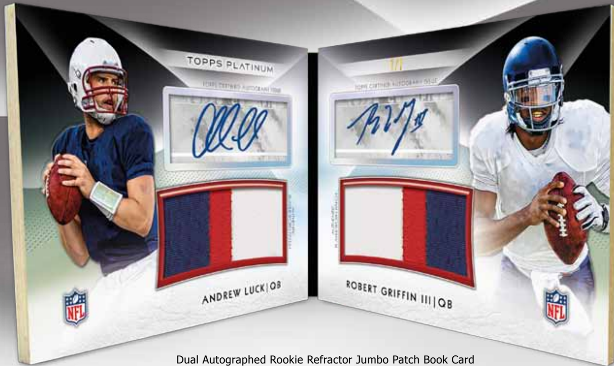
Dual Autographed Rookie Refractor Jumbo Patch Book Card

AUTOGRAPH REFRACTOR PATCH CARDS 1 Per Box!