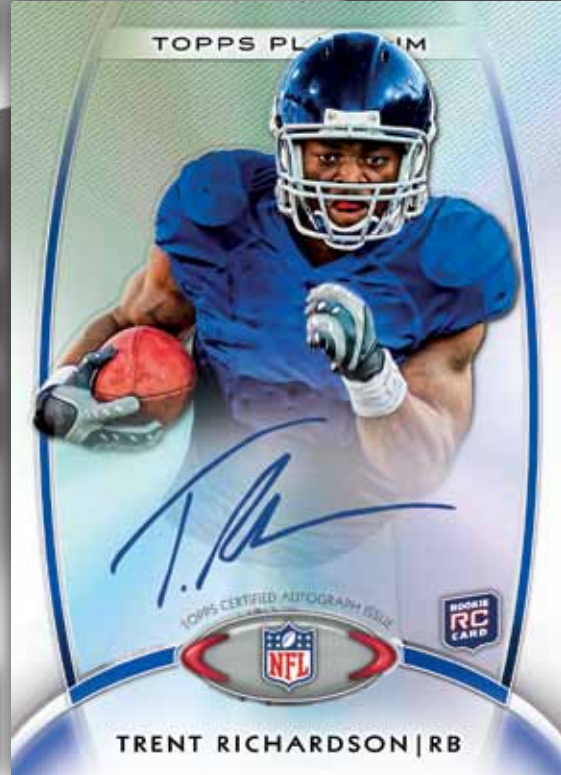
Autographed Rookie Card

AUTOGRAPH ROOKIE REFRACTOR CARDS 2 Per Box!