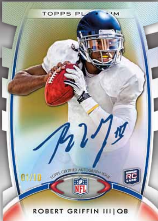
Autographed Rookie Gold Refractor Die Cut Parallel Card