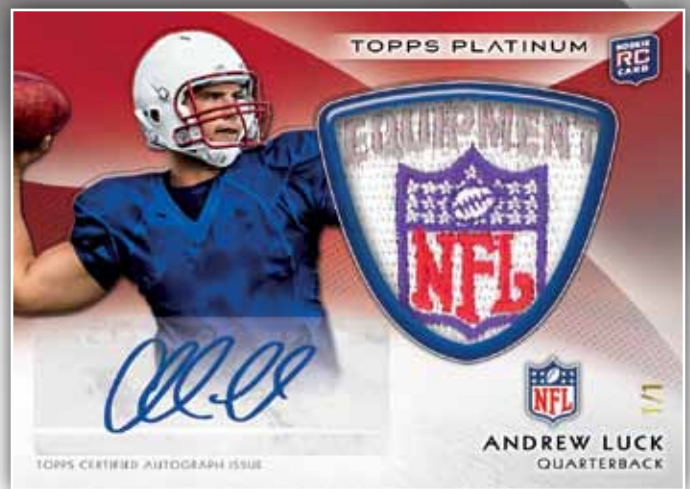
Autographed Rookie Red Refractor NFL Shield Patch Parallel Card