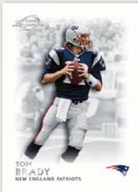
Veteran Base Card