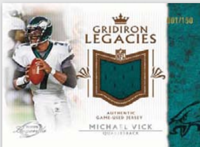
Gridiron Legacies Relic Card