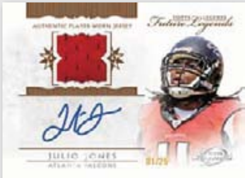
Topps Future Legends Autograph Relic Card