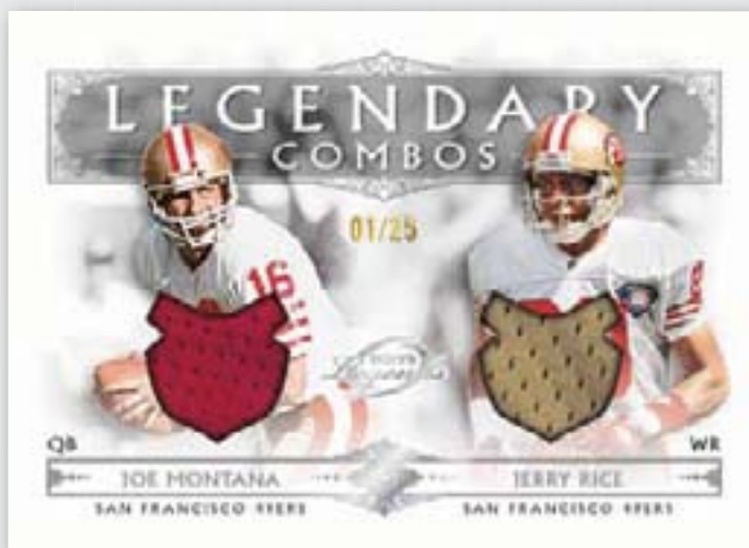
Legendary Combos Relic Card