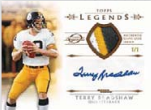
Topps Legends Autograph Patch Card